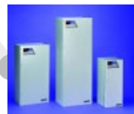
Compact to Full-Size

All models feature a thermostat control with digital display of enclosure temperature and a high temperature alarm. Most inside components are accessible by removing the grill and filter.