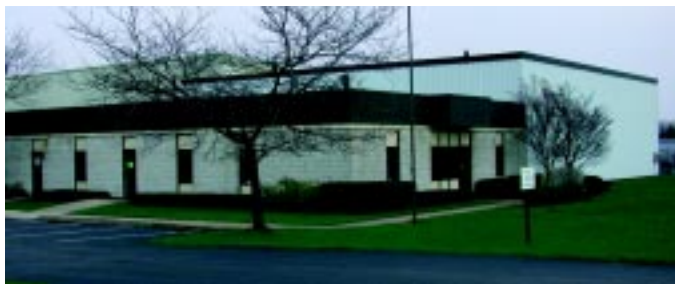
Above, the exterior of Winkle Electric's new distribution center and sales office in Erie.

In addition to Allen-Bradley, the new Pennsylvania locations will offer virtually all the products and services currently provided from the Youngstown location. The Seneca sales office is now open, and the Erie location will open in the middle of May. The Meadville facility is slated to open in July.