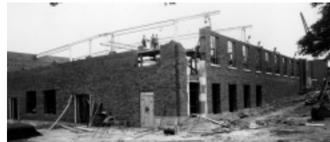
The building (above, under construction) which now serves as Winkle Electric headquarters was originally built as the Wehle Baking Company in 1929.

For a demonstration of either Rockwell's RSBizWare™, Panduit's Viper LS6 Thermal Transfer Portable Printer, or both... please contact your Winkle Electric sales representative or call 330-744-5303.