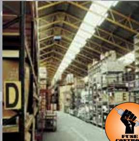
FERRAZ SHAWMUT Fuse Control™