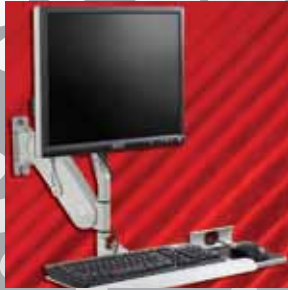
HOFFMAN SysPend Vertical Motion Arms