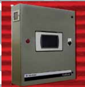
ROCKWELL AUTOMATION FanMaster™ Energy Saving Package