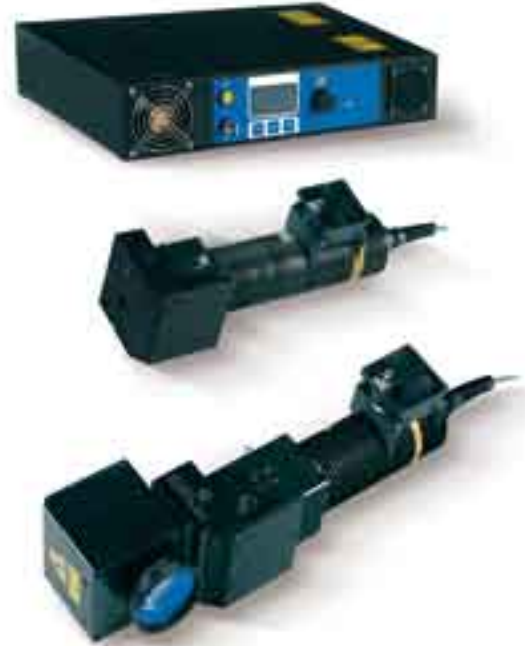
The Lase platform is available in the OEM and OEM marker version.

The Lase platform extends drastically the possibility of connection between the laser source and the operating system. The communication with the system is enabled by RS232, RS485, and Ethernet. In addition, the Lase platform also has an I/O for the connection of the TTL and analogue signals.