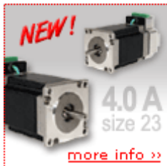
SMD23 (size 23)

Have you seen the AMCI SMD23 Size 23 Integrated Stepper Motor Drive?